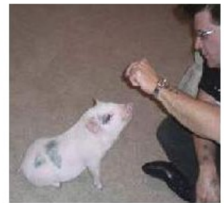
"Kito" sold as a "teacup pig" - above 2 months old