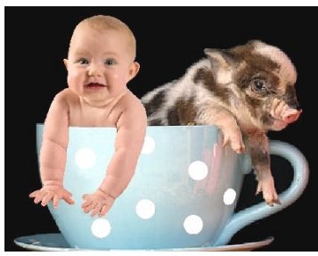
Just like human babies, these "teacup" piggies do grow up!