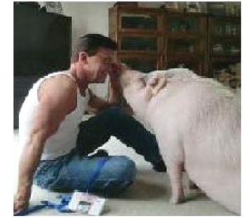
"Kito" - 2 years old - 140 pounds